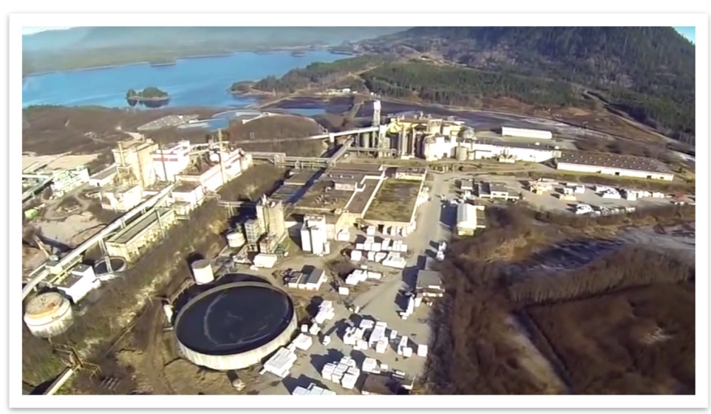
Watson Island (pictured above in 2013) was a significant environmental and security cost to the City prior to the removal of the pulp mill

Prince Rupert Legacy Inc. was initially founded in 2014 to negotiate with Exxon on Lot 444 for an LNG project (which is no longer proposed). Later, Legacy leased Watson Island from the City in order to repurpose the property. These initial funds from Lot 444 as well as new revenues from Watson Island have since been transferred to